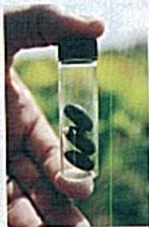
Seeds from jatropha trees grown in Florida can be crushed and the resulting oil processed to produce a high-quality biodiesel fuel.

Bio-business heats up: In spring 2009, Delray Beach-based biofuel startup Ag-Oil LLC planted 20 acres of jatropha; when the trees mature in 18 months, the seeds will be used to make biodiesel fuel. The company received a $2.5-million Florida renewable energy grant to build a $20-million biodiesel production facility that is expected to support more than 1,000 direct and indirect jobs, says Brian Weprin, Ag-Oil's project manager. Why Delray Beach? The location is seven miles from I-95 and a CSX rail line, and close to expansive agricultural